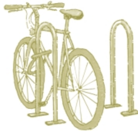
Inverted "U" (Class II)

Lockers: Bicycle lockers are a great option for employees and commuters, who need longer-term parking. A locker is a fully enclosed space accessible only to its owner. Lockers provide secure weatherproof storage for bicycle parking. They are ideal in areas where long-term or enclosed lots have been provided for automobiles.