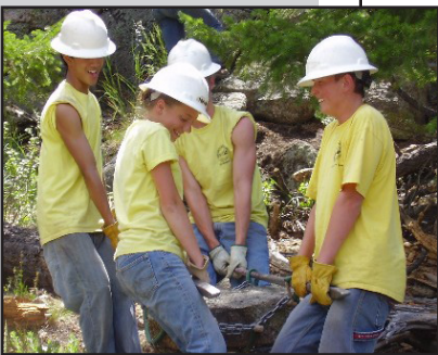
The OSMP Junior Rangers program assists in trail construction and restoration.

The Water Rights Acquisition program provides funding to purchase additional water shares for use on Open Space for agricultural and environmental purposes, as water becomes available in the Coal Creek, South Boulder, Boulder and Lefthand Creek watersheds.