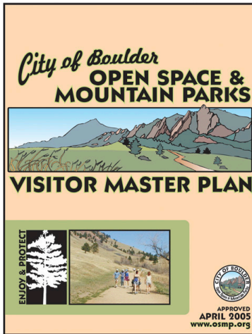
Open Space & Mountain Parks Visitor Master Plan.

There do not appear to be any emerging needs at this time.