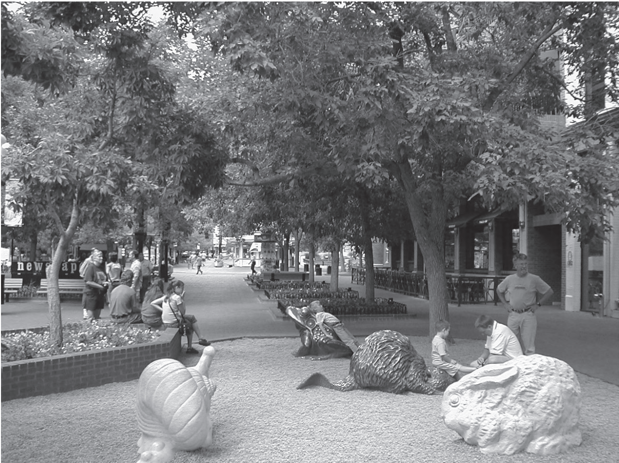
Figure 16 —Trees shade the pedestrian area of the Pearl Street Mall, providing Boulder’s residents with cleaner air, reduced atmospheric CO 2 , cooler summer temperatures, and a more beautiful, economically viable environment.