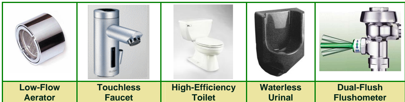
Table of Water Saving Options

Demonstrating your commitment to water efficiency will make a positive impression on your staff and the public. Some of the measures listed below can likely be applied to your business. The table below illustrates the associate water savings and cost benefits. We can all do our part to use water more effectively, thereby improving water quality and preserving our drinking water resources.