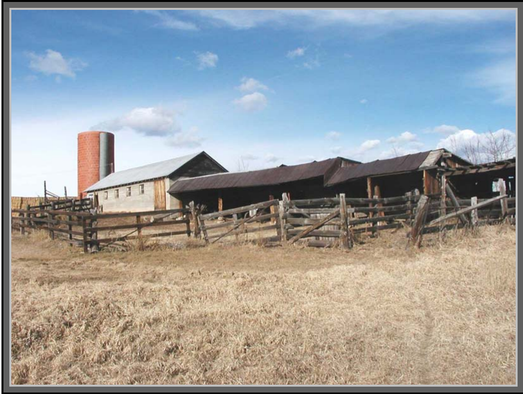
Hunter/Kolb Property, 40 acres, purchased in April of 2008, along Arapahoe Road. (Preservation of agricultural uses.)

Please note, pursuant to Section 9-8-6 B.R.C. 1981, not all newly-acquired properties pictured are available for public use.