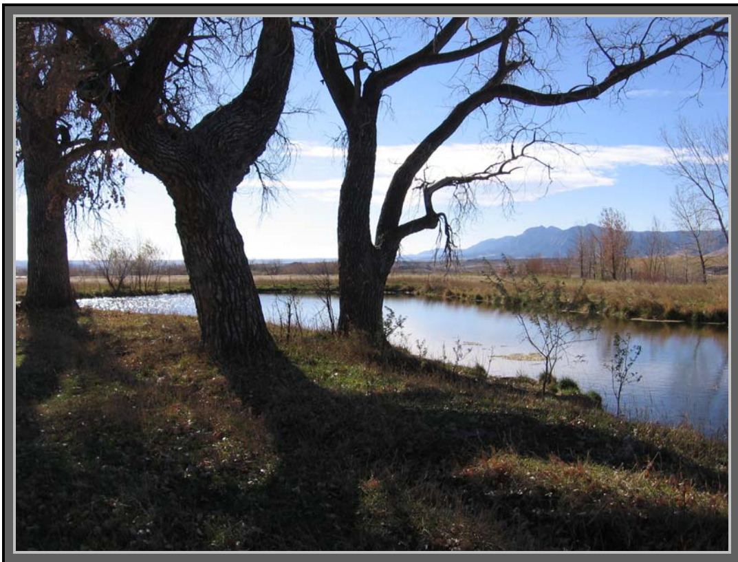
Stratton Property – 80.8 acres purchased in 2007. (Preservation of water resources, scenic vistas, wildlife habitats, fragile ecosystems, agricultural uses.)