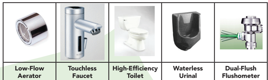
Table of Water Saving Options

Water efficiency is great for the environment and for your business's bottom line. Water-efficiency measures can lower your water and energy bills as well as improve operations. Low-cost and technological opportunities abound for using water efficiently in commercial bathrooms. Demonstrating your commitment to water efficiency will make a positive impression on your staff and the public. Some of the measures listed below can likely be applied to your business. The table below illustrates the associate water savings and cost benefits. We can all do our part to use water more effectively, thereby improving water quality and preserving our drinking water resources.